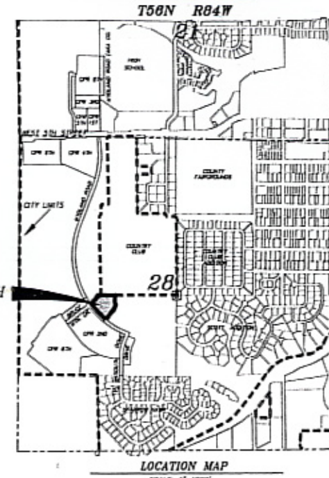
CLOUD PEAK RANCH SEVENTH FILING

9 LOTS = ±1.67 ACRES 5 OPEN SPACES = ±0.28 ACRES 1 STREET/ROW = ±0.66 ACRES TOTAL = ±2.61 ACRES ZONED R-3